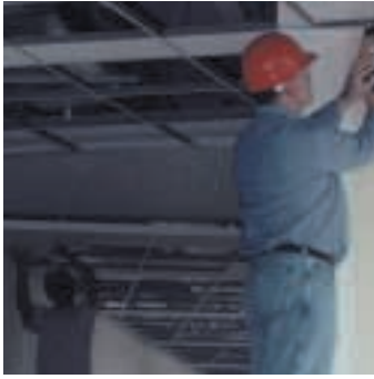
Interior applications for walls and ceilings