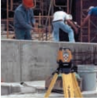
Site preparation in exterior applications