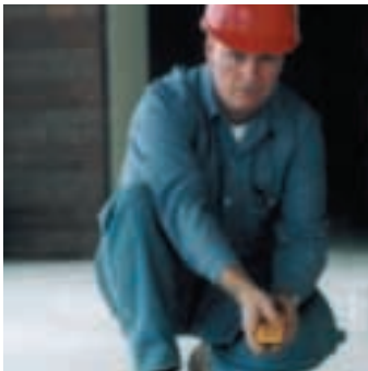
One person setup using optional remote control