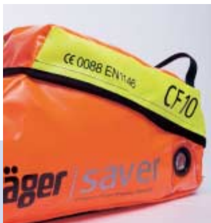
Saver CF10 (order code:- 355 0490) Saver CF10 (order code:- 355 0492) with DIN Cylinder