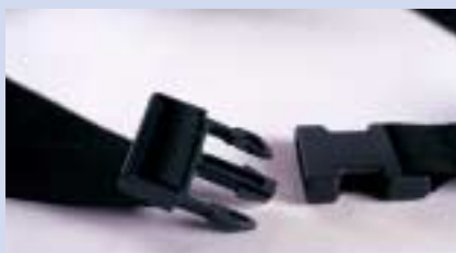
Waistbelt (order code:- 355 0396)