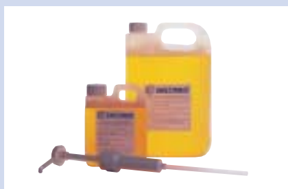
Safety Wash 1 litre Dispenser (order code:- 358 0164) 1 litre Refill (order code:- 358 0165) 5 litre Dispenser (order code:- 358 0166) 5 litre Refill (order code:- 358 0167)