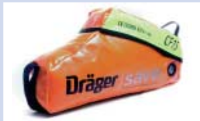
Anti-Static Bag 10min (order code:- 355 0646) Anti-Static Bag 15min (order code:- 355 0647)