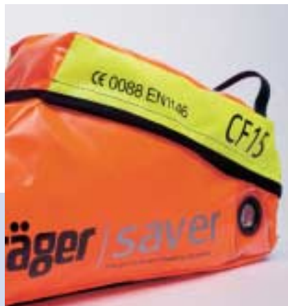
Saver CF15 (order code:- 355 0491)