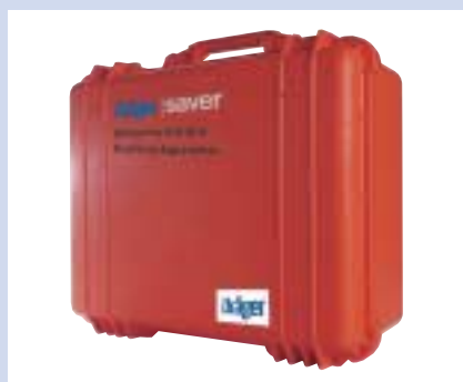
Storage Cabinets (order code:- 355 0424) Wall Mounting Kit (order code:- 355 0431)